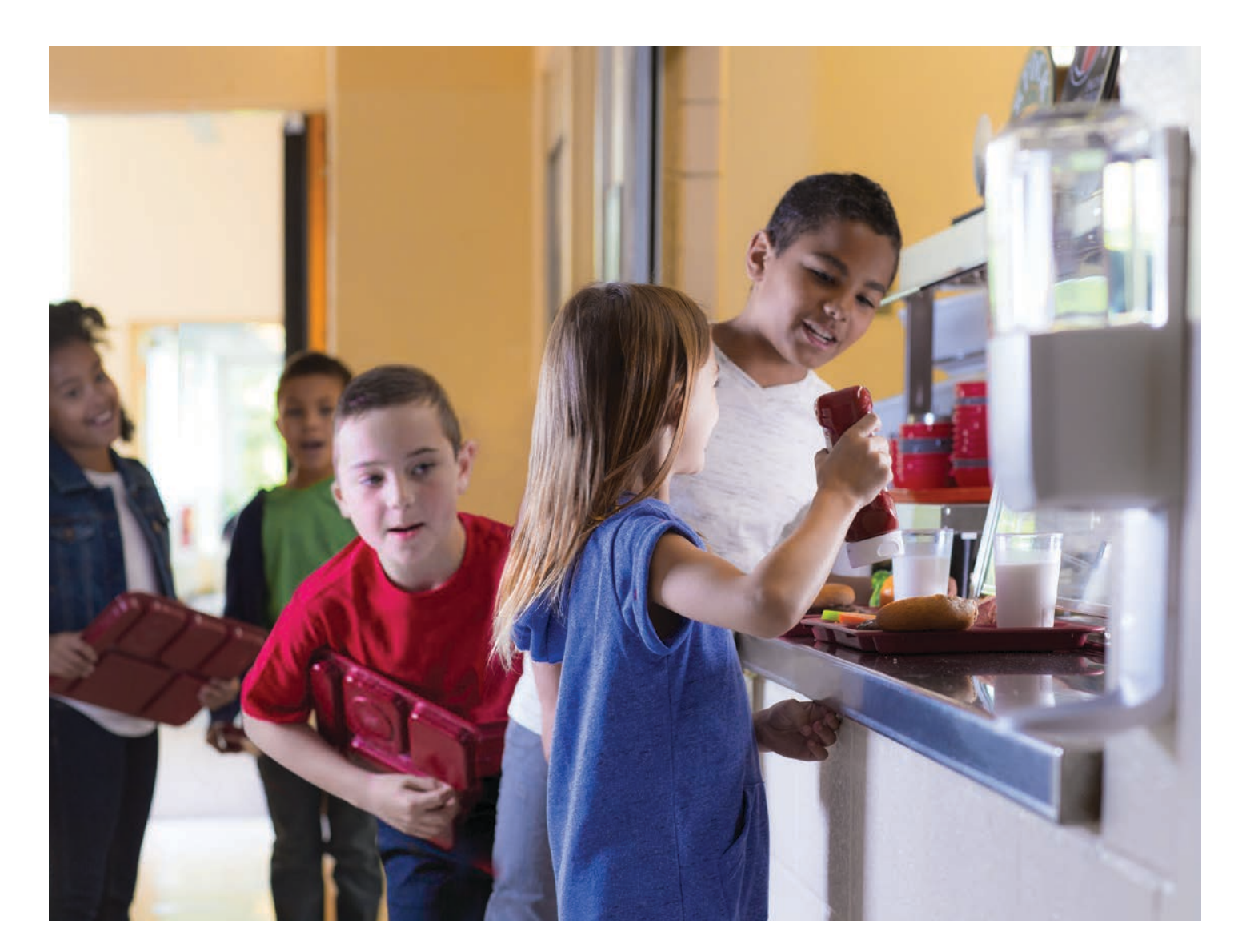
Skin Health and Hygiene Solutions from the inventors of PURELL® Hand Sanitizer

PURELL® Multi-Surface Disinfectant PURELL Hand Sanitizer PURELL Stands and Accessories PURELL HEALTHY SOAP™ Classic Dispensing System PURELL Classic Systems 16 GOJO Classic Systems GOJO® Heavy Duty Soap & HAND MEDIC® Skin Conditioner