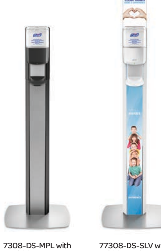
77308-DS-SLV with 7399-HB-SLV and 320-01-HC2 MESSENG